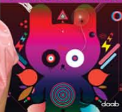
YOUNG ASIAN GRAPHIC DESIGNERS