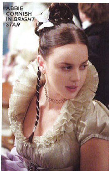
ABBIE CORNISH IN BRIGHT STAR

Derek Blasberg (@derekblasberg) is a superior tweeter who gets invited to every A-list party and VIP fashion event, wittily surveying the bold-faced names he runs into (Natalia Vodianova and Courtney Love in the same hour!). This month, his book of hilarious illustrated essays called Classy , hits shelves.