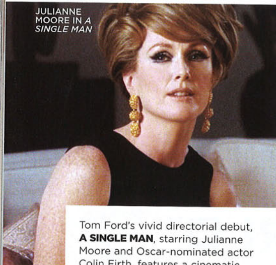
JULIANNE MOORE IN A SINGLE MAN