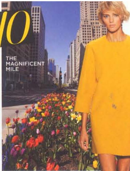
THE MAGNIFICENT MILE