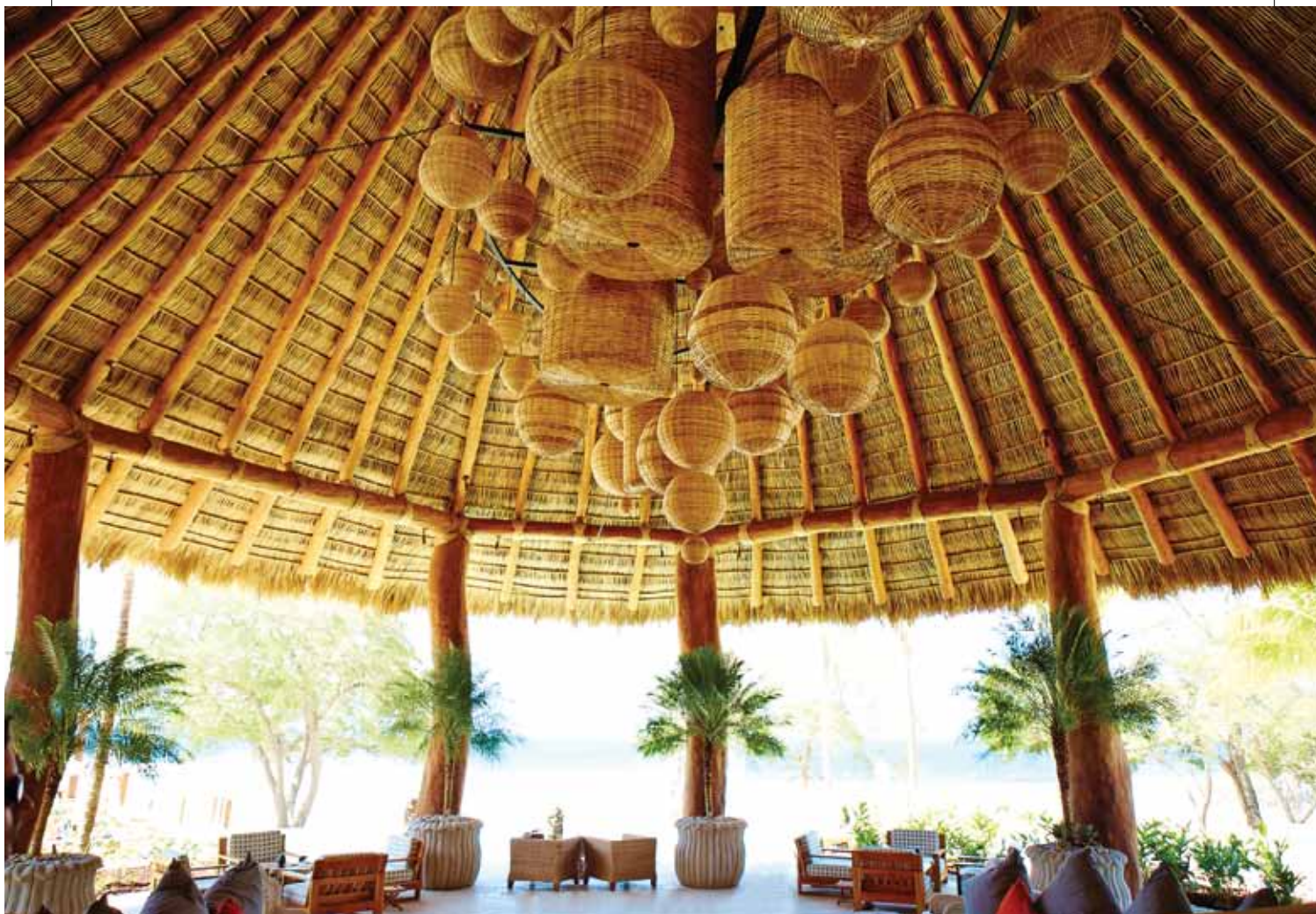
ARTISAN-INSPIRED DECOR IN MUKUL'S BEACH CLUB LOUNGE

ELIO IANNACCI maps out some of the world's most distinctive destinations.