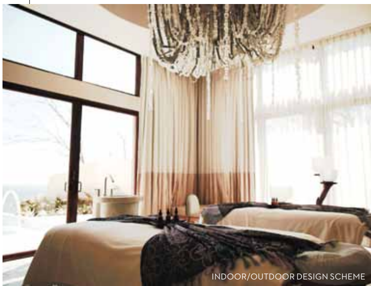
INDOOR/OUTDOOR DESIGN SCHEME

One of the best reasons to stay at Mukul is the way the professional staff connects with guests. A nearby hotel school, also funded by the Pellas family, employs experts in customer service from around the world who come to guide Mukul's staff through the hosting arts.