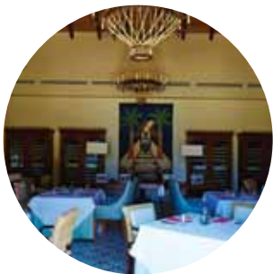
LA MESA DINING ROOM