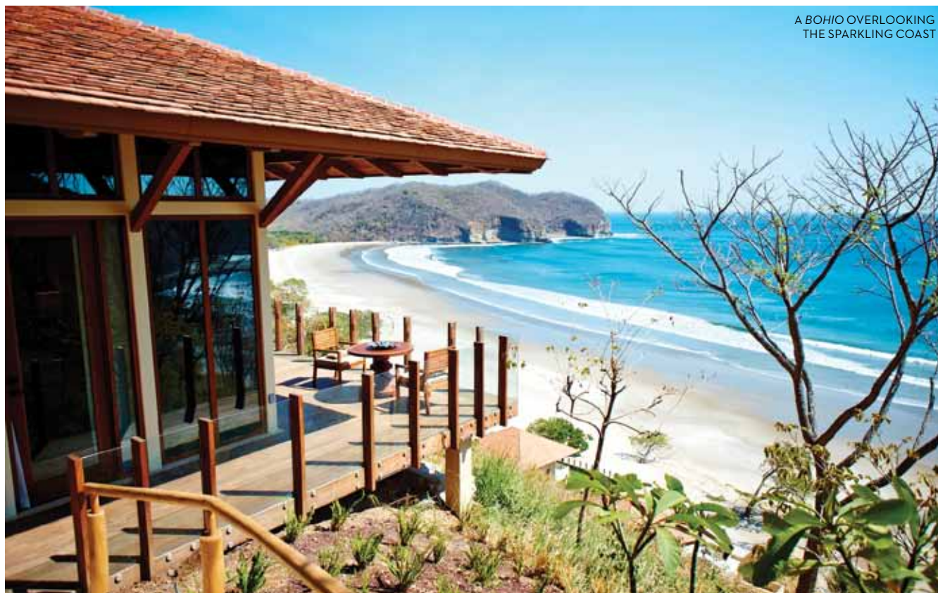
A BOHIO OVERLOOKING THE SPARKLING COAST